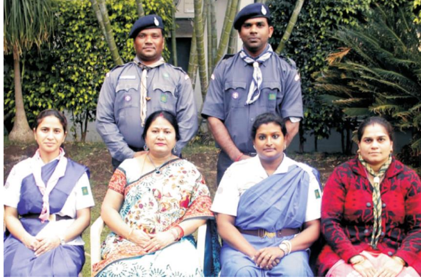
Scout and Guide Trainers (Teachers Credit) 2018-2019